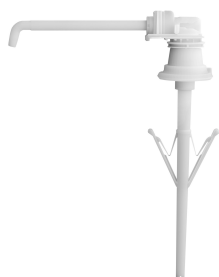
Disposable plastic pump for MEDCARE dispenser